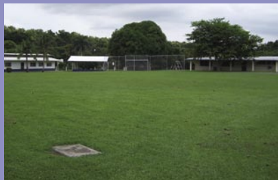
TOP: Part of national convention crowd. LEFT: Abel, a 2008 seminary student. RIGHT: View of seminary complex.